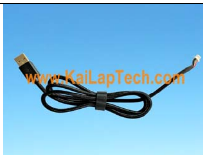
Соединительный USB-кабель Деталь No. KLT-USB1A-Cable

Удлинитель кабеля USB. Продано отдельно.